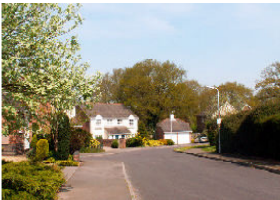
East Dorset District Council Policy Planning Division Supplementary Planning Guidance No. 20 January 2007

1.5 The quality of the environment can be improved dramatically at a tiny percentage of the total cost. This has obvious advantages in terms of marketability and good landscaping offers lasting benefits to the residents and to the community as a whole.